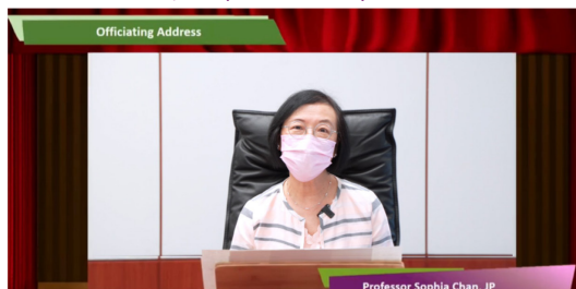
Officiating address by Prof. Sophia Chan, Secretary for Food and Health