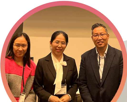
Professors and student attended international conference

Availability of various scholarships and awards to encourage students to strive for excellence